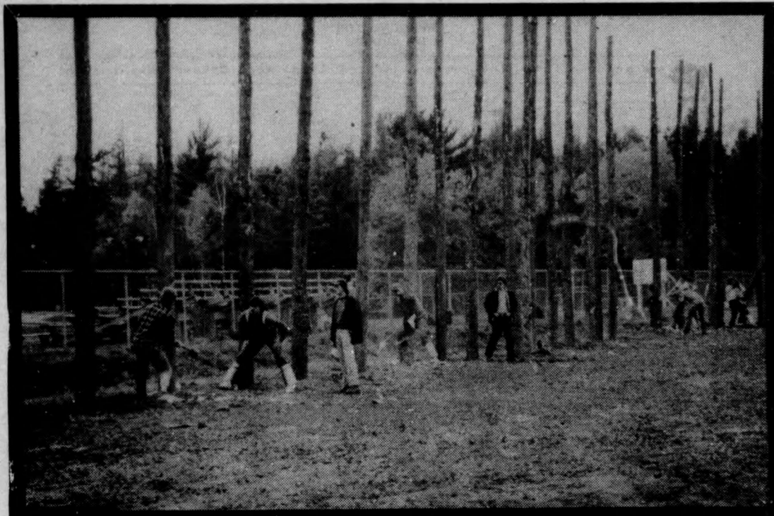
Fell and Twitch