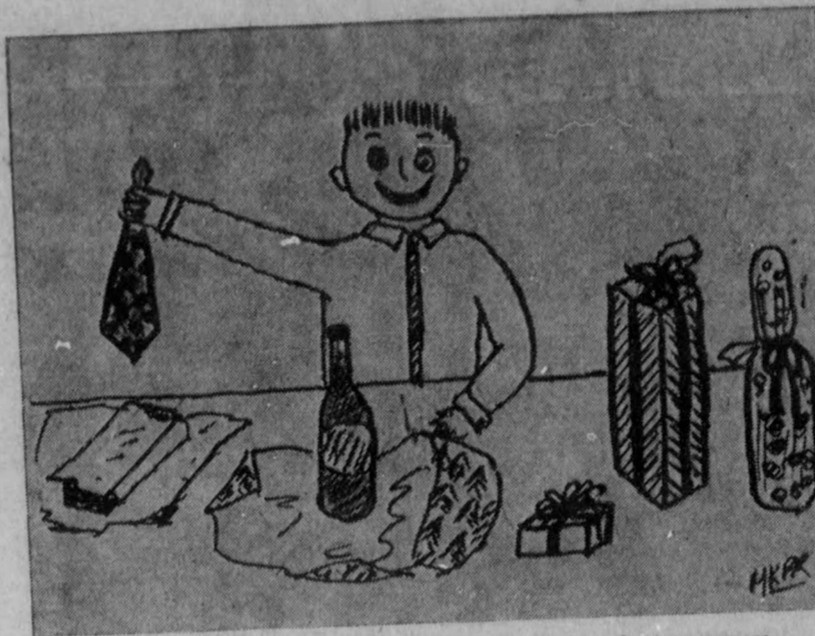
Thanks Dad—just what I wanted . . . nice tie too, mum.

To all our readers, we sincerely wish a good and meaningful Christmas, and a pleasant holiday. When you come back, the campus and its inhabitants will seem a lot fresher. To those of our readers who are not Christians, we wish a pleasant and relaxing holiday, hoping that you will share with us our reaffirmation of "Peace on Earth, Good Will to Men."