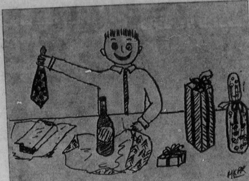
Thanks Dad-just what I wanted . . . nice tie too, mum.