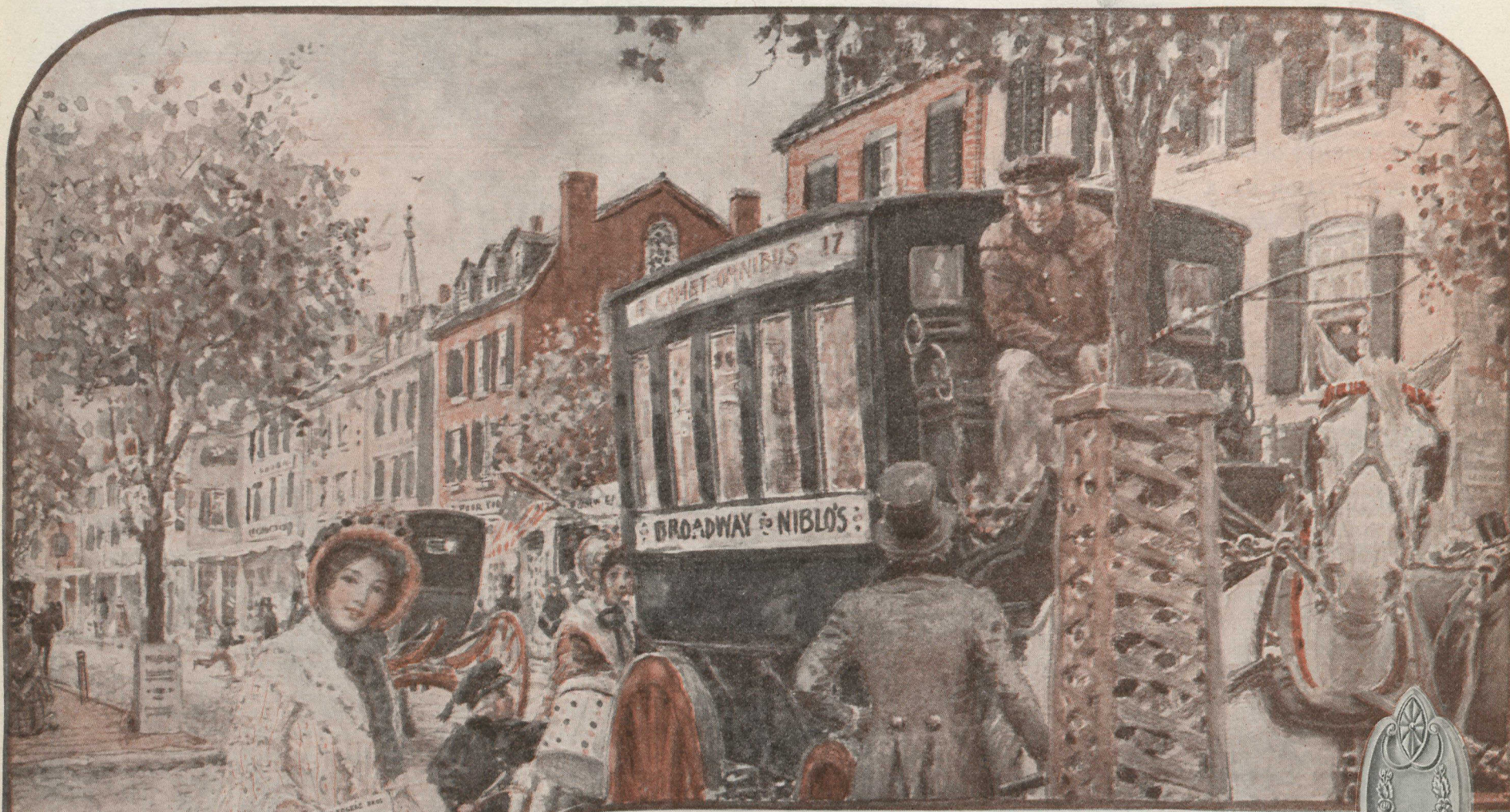
Broadway, at Leonard Street, New York City, 1847.

A bit of realism is portrayed in the picture which is true to life as it was on Broadway in 1847. Then it was that the silver spoons, forks and knives produced by Rogers Brothers and destined to become celebrated as