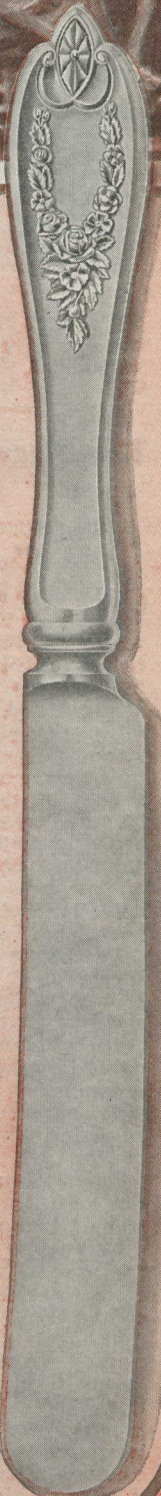
Old Colony Knife