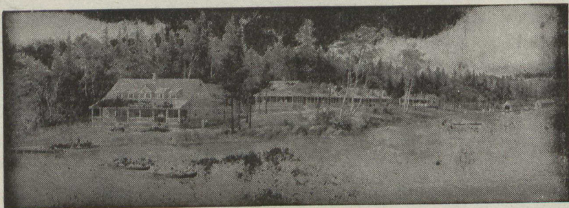
"Nominigan Camp"—Smoke Lake.

Ideal Canoe Trips—A Paradise for Campers—Splendid Fishing, 2,000 Feet Above Sea Level.