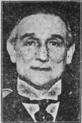
Stated for the East Lord Reading, former British Ambassador to the United States, who has accepted the vice-royalty of India.