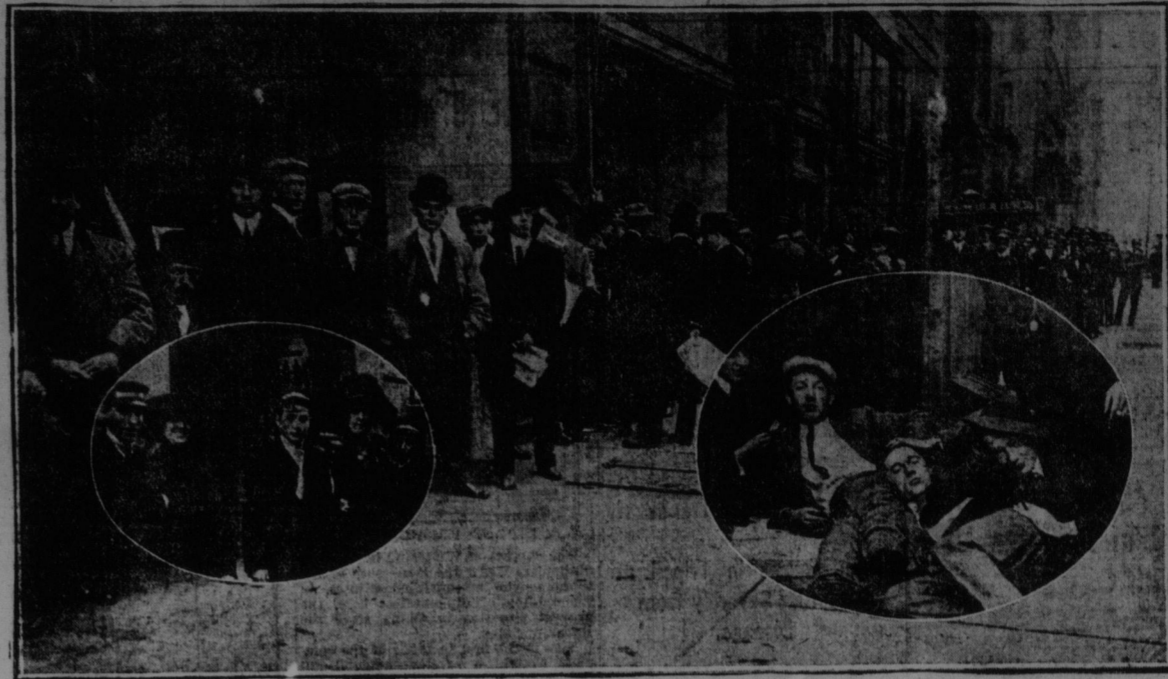
IN LINE FOR TICKETS--WOMEN FANS--IN THEIR EARLY HOURS