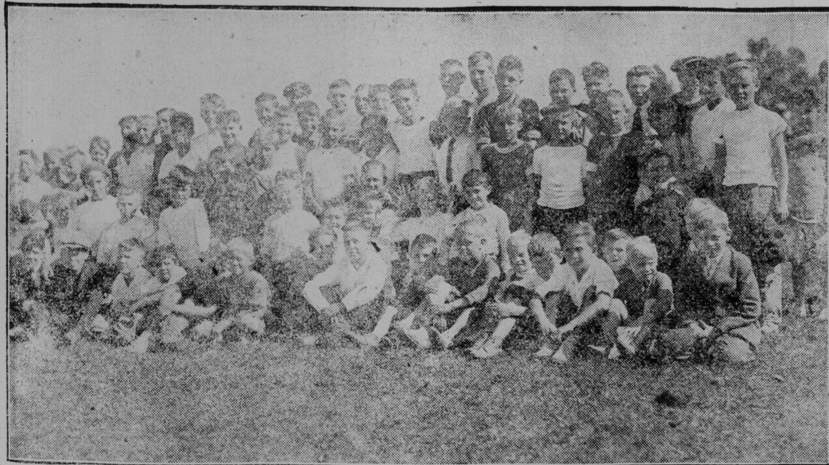
Children from the Sunnyside Home at the International polo races at the Woodbine.