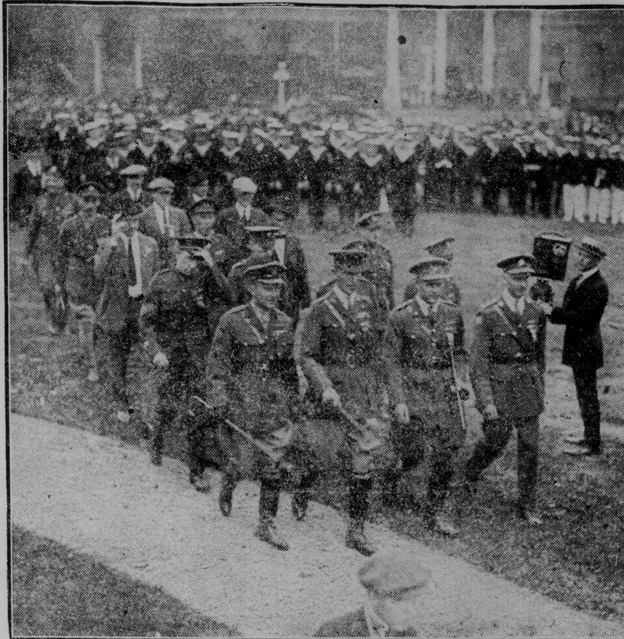
Arrival of Victoria Cross men at the band stand for the reception at the Canadian National Exhibition.