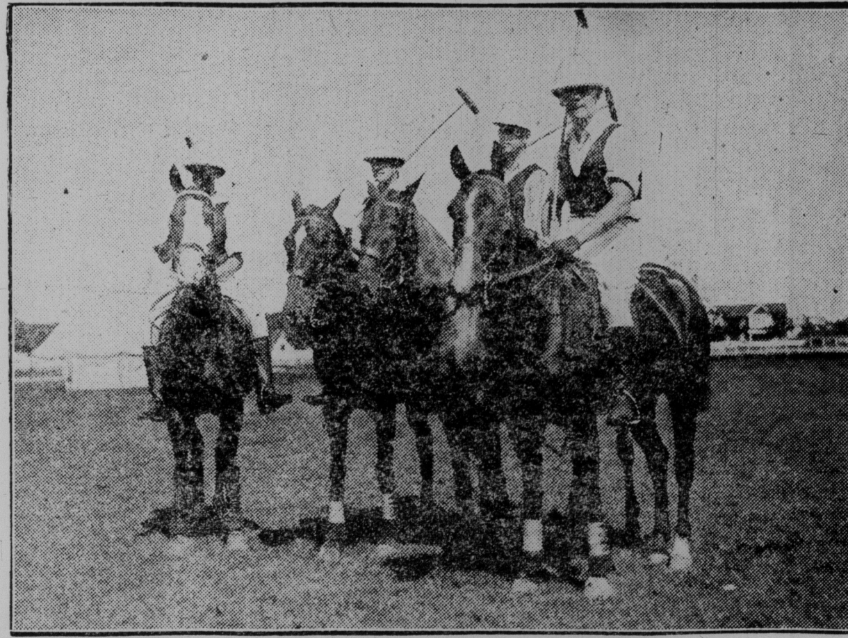
Buffalo polo team at the International polo matches at the Woodbine, showing Capt. Coleman Curtis third from the left.