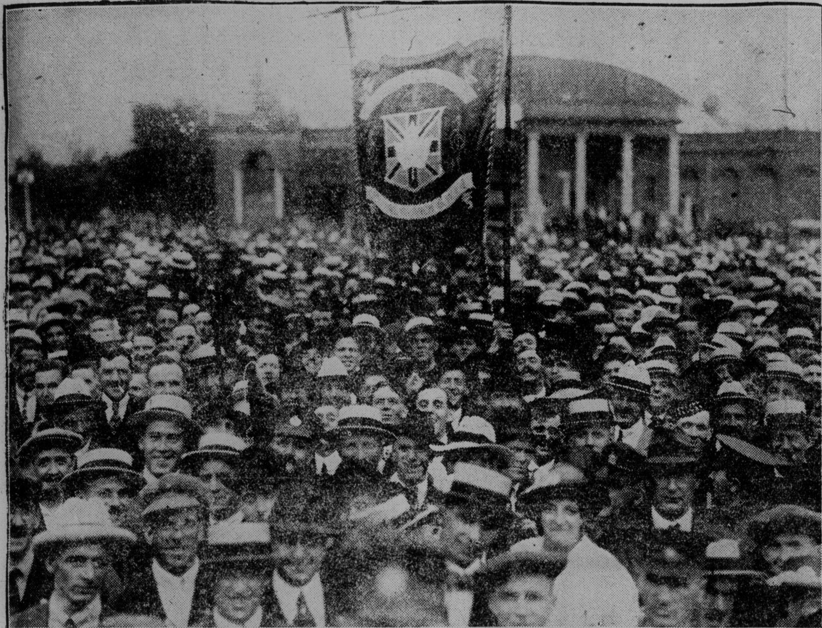
Great War Veterans' banner and general view of the crowd at the opening of the Canadian National Exhibition.