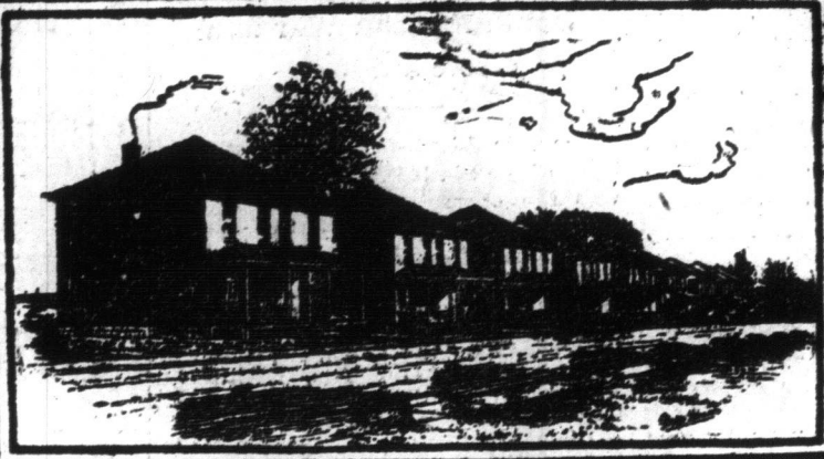
Goodyear Houses, Carlisle Ave. Bowmanville