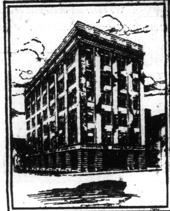
Head Office, Toronto