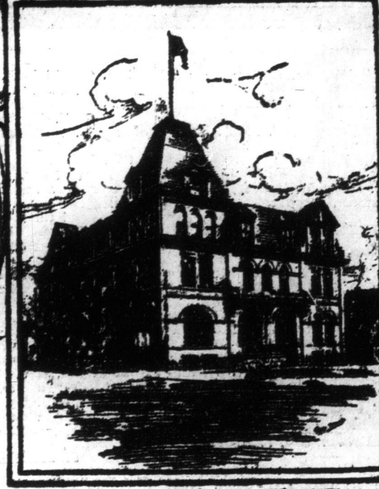
Goodyear Club Bowmanville