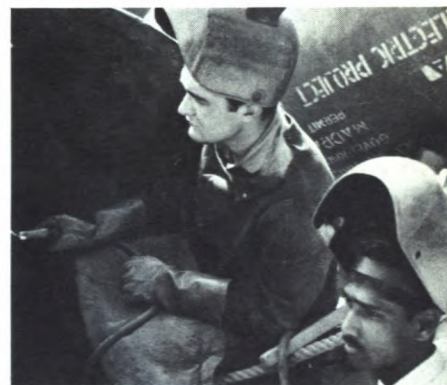
Canadian and Indian welders at the Kundah Dam in India.