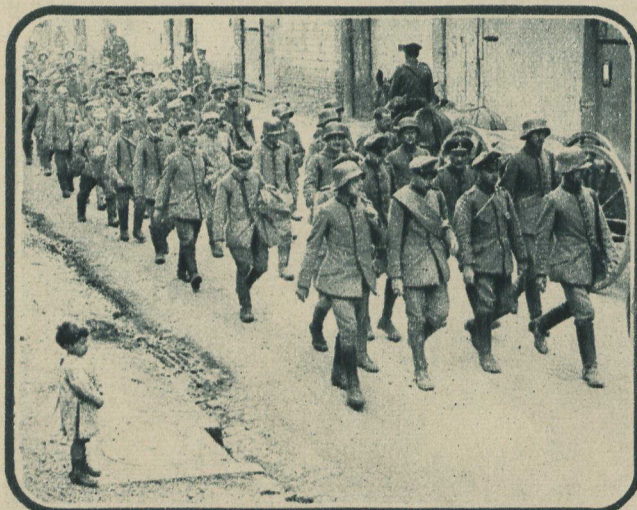
This small boy is not the least afraid of German prisoners.