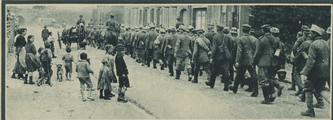
Hatred of the Boche is deep in every French child's heart, but they make no sign as the prisoners go by.