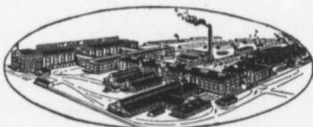
Where Cockshutt Plows are made

T HIS plow combines great strength, durability and remarkable light draft. It has been carefully and thoroughly tested, and will do perfect work. The frame is built to combine strength with the least weight. A special feature of this plow is the adjustable frame. By unloosening two bolts and two set screws, it can be adjusted to any width from 7 to 10 inches, within a few minutes. It has our new fine adjustment ratchets for gauging the depth of the furrows. Levers are conveniently placed and are easy to operate. The wheels are absolutely dustproof—straightener device can be fitted to plow when called for. This plow can be handled by two horses, yet is quite strong enough to stand the strain of three. Can be fitted with wide or narrow bottoms, rolling colter, knife colter or jointer. This is without doubt the most popular two furrow plow manufactured.