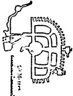
TOMBS OF THE PROPHETS