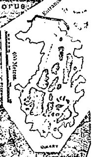
TOMBS OF THE KINGS