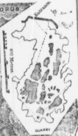
TOMBS OF THE KINGS