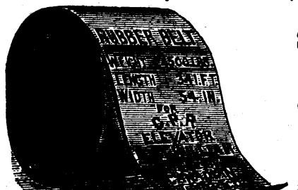
Western Branch cor., Front and Yonge Sts. TORONTO.