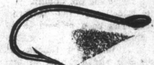
(THE RELIABLE HOOK).

The prices of these well-known and popular Hooks have been reduced.