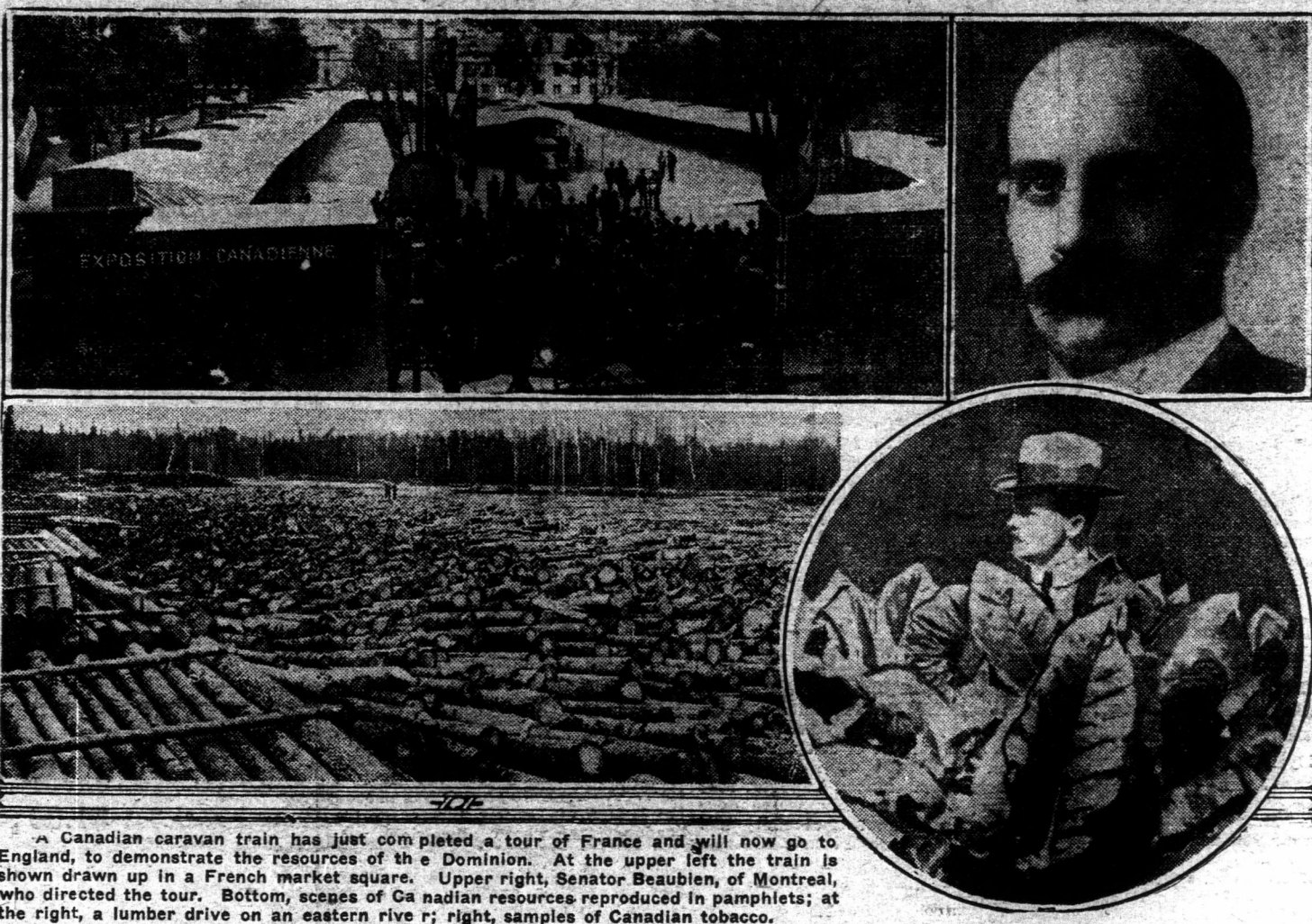
A Canadian caravan train has just completed a tour of France and will now go to England, to demonstrate the resources of the Dominion. At the upper left the train is shown drawn up in a French market square. Upper right, Senator Beaulieu, of Montreal, who directed the tour. Bottom, scenes of Canadian resources reproduced in pamphlets; at the right, a lumber drive on an eastern river; right, samples of Canadian tobacco.