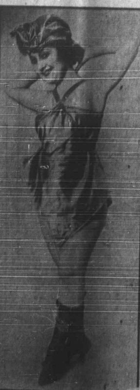
Peggy Mendel One of the Bathing Beauties with the Katzenjammer Kids, Opera House, July 17.

Statistics just compiled indicate that there are 5,000,000 automobiles with starting and lighting systems now in use in the United States. The average life of each automobile storage battery is less than 23 months. This means that within the next two years there will be a demand for 5,000,000 replacement batteries besides the thousands added every day in new cars now being produced.