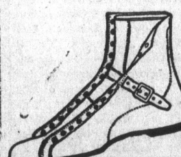
Ladies' and Girl's Hockey