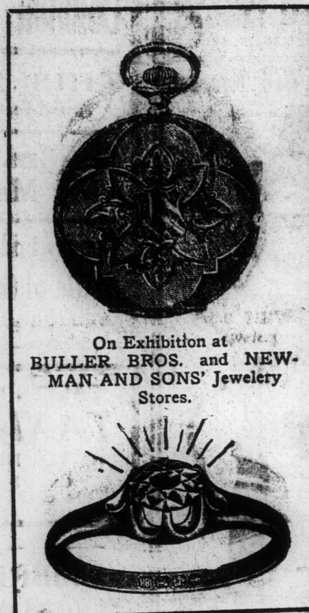
On Exhibition at BULLER BROS. and NEW- MAN AND SONS' Jewellery Stores.

Great Vote Offer Ends Saturday Night, 8 O'clock