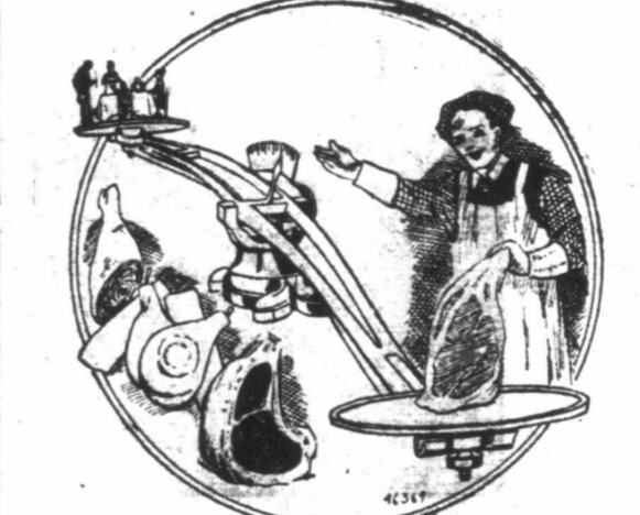
THE HEIGHT OF SATISFACTION