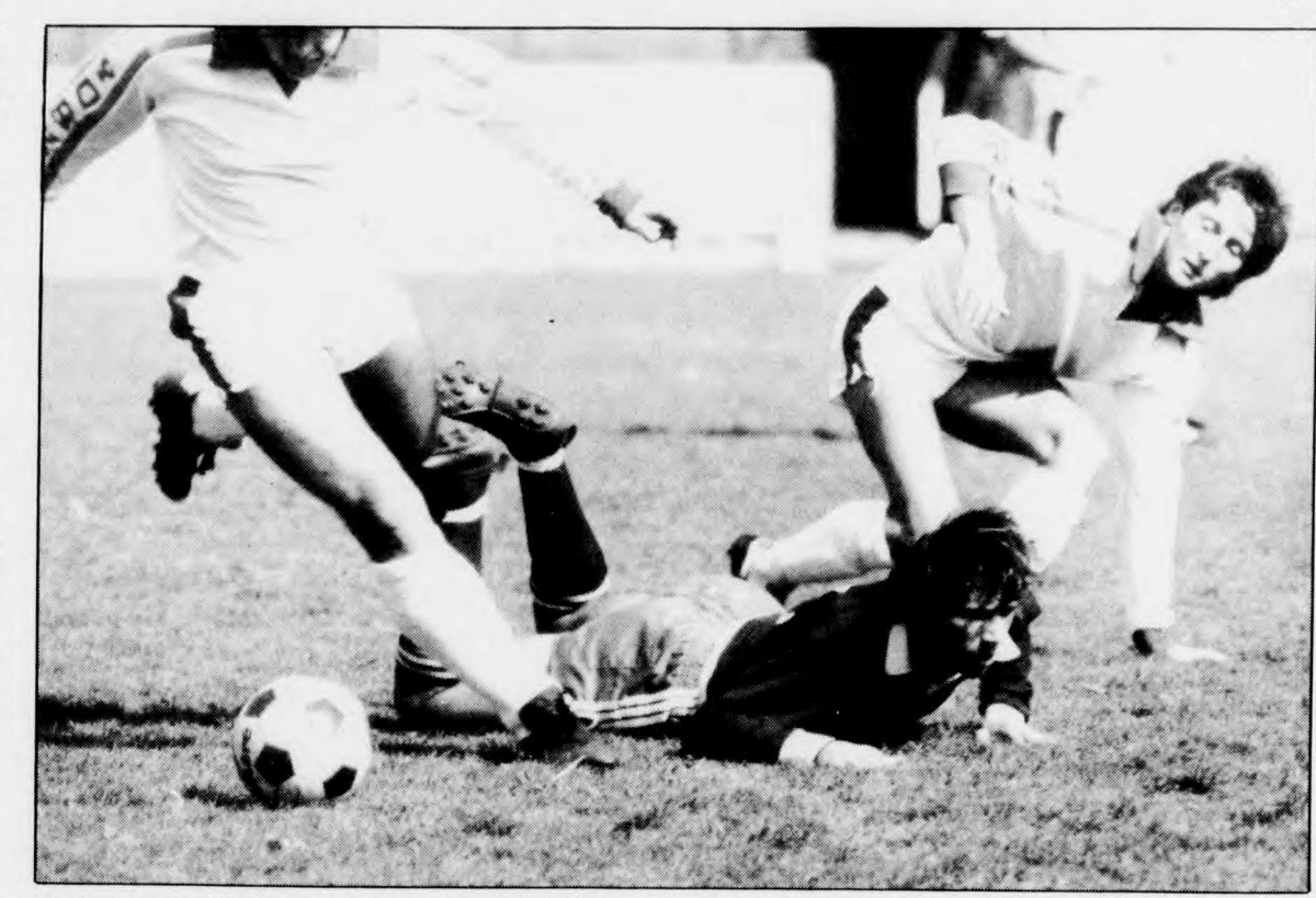
This is a photo of York Yeomen playing soccer. Well, actually, we don't know who it is; this is a photo we plucked from the files.

The clubs involved are usually either CSL (Canadian Soccer League) or NSL (National Soccer League) teams. Playing for these squads during the summer and keeping CIAU eligibility for the university season is accomplished