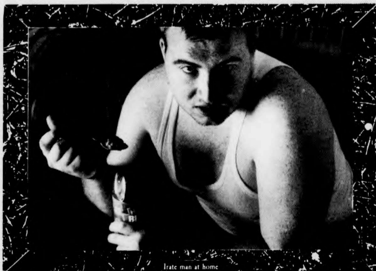
irate man at home