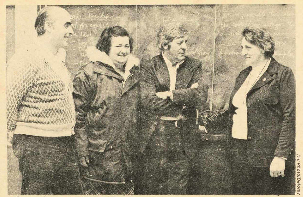
Representatives of University cleaning and maintenance staff say they will strike unless the university offers them reasonable wage increases.