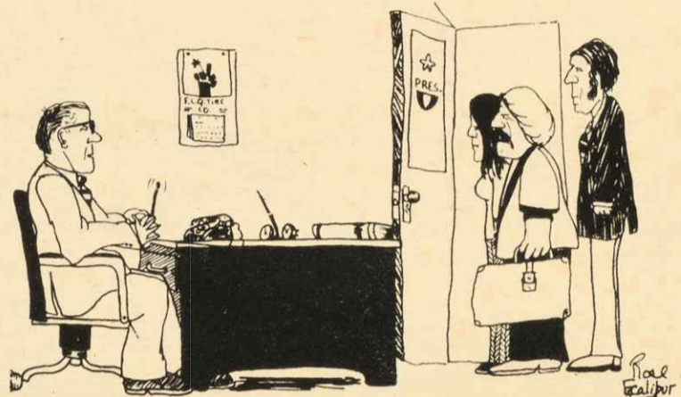
"I'm glad you young people have seen fit to protest non-violently. It shows you're civilized. Now get out."