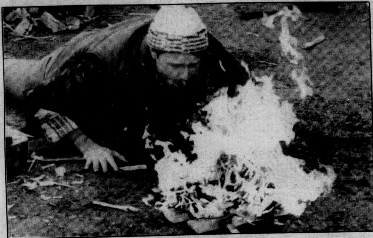
Blow by blow account of firestarting