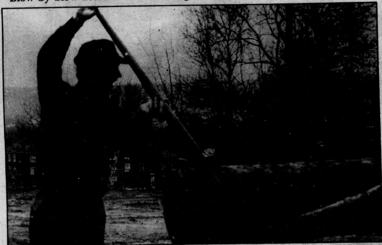
Talk about a vice-grip!