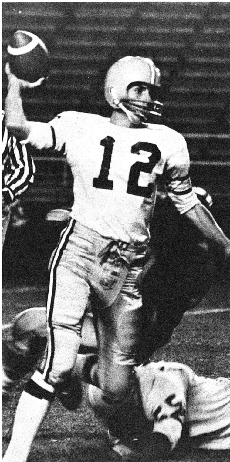
A LOT OF EXCITEMENT WHEN YOU'RE WINNING

But no longer do you go to the Saturday matinees at the