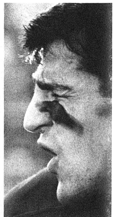
THINK ABOUT IT, BUDDY

This story is for the rest of you. The ones who do not have a Great Idol but have