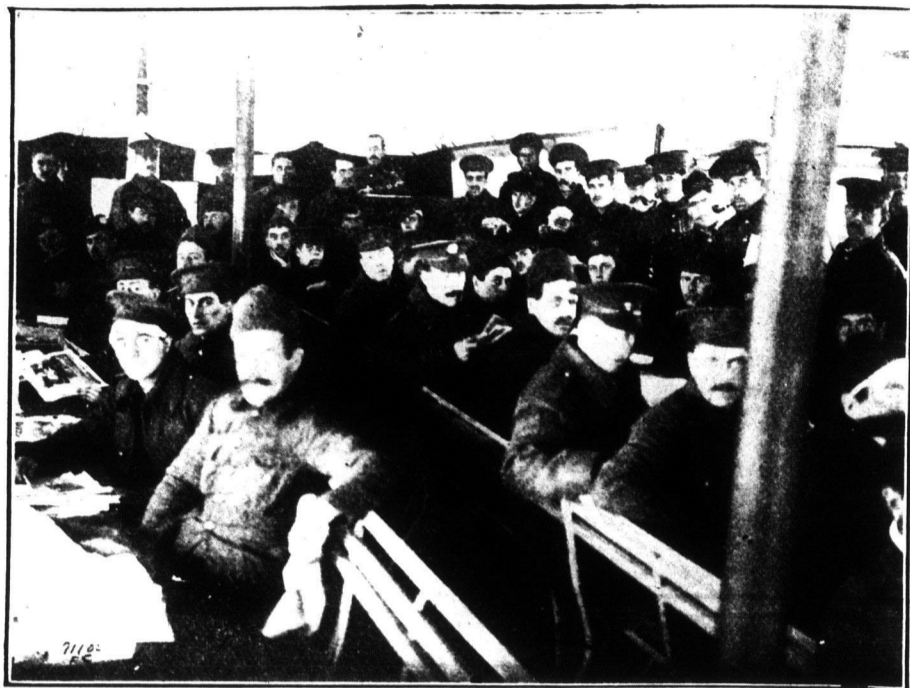
British convalescent camp in the north of France, where wounded soldiers are regaining health and strength before returning to the firing line.