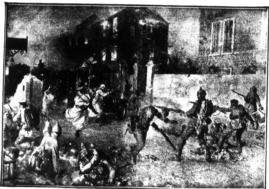
An exciting incident in the town of Senlis, France. After being in occupation of Senlis for three days, burning the town and shooting the wounded, the Germans were suddenly surprised by a dash of French, who whirled into the town in taxicabs, and after a fierce fight drove out the enemy.