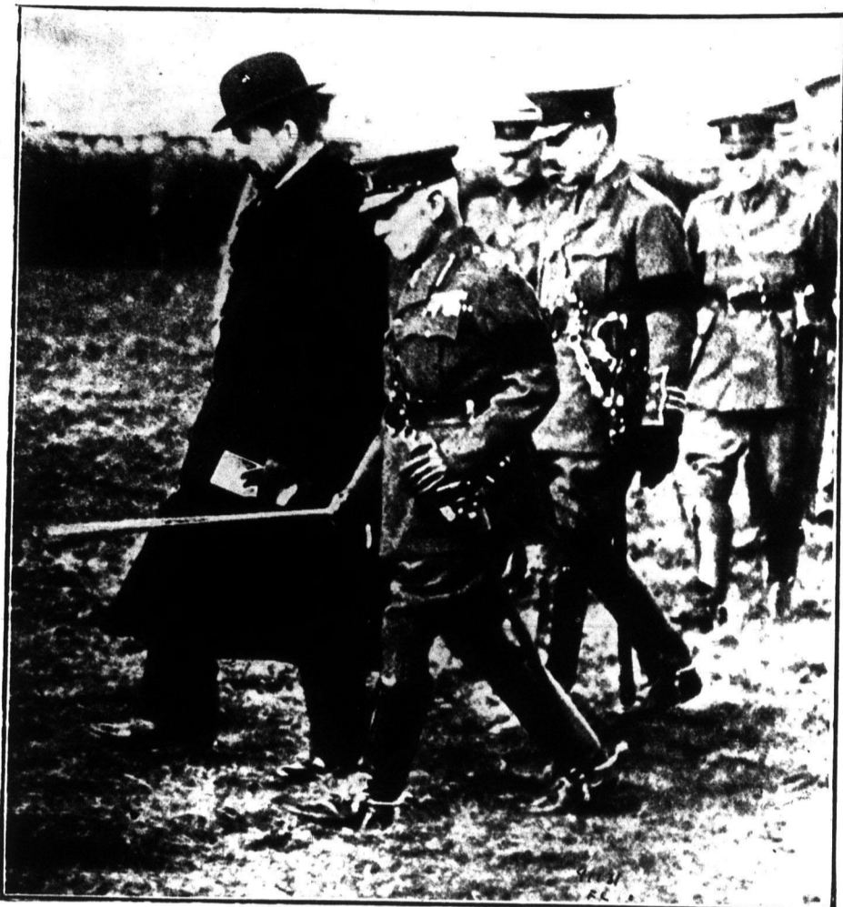
The Late Lord Roberts' last inspection. "Little Bobs," as he was affectionately known, whose sudden death on the evening of November 14, came as a shock, is seen in this photo, which was made November 4, at Salisbury Plains, during his inspection of the Canadian troops there.