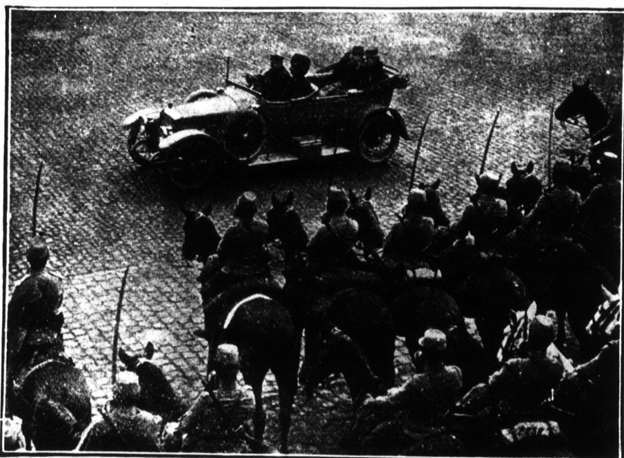
Fighting King of Belgium and French President Poincaré reviewing Allies at Furnes. In the rear seat of car the King is at left of the President.