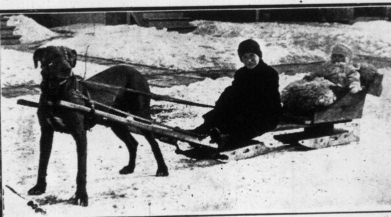
PAIR OF ANGLO-SAXONS AND A DANE.

High Park-avenue during the recent thaw, when the heavy walking kept the daily quota of pleasure-seekers away from the popular resort.