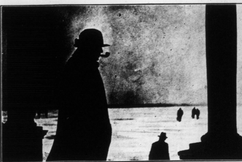
MOONLIGHT ON THE BAY—A STUDY IN SILHOUETTE.