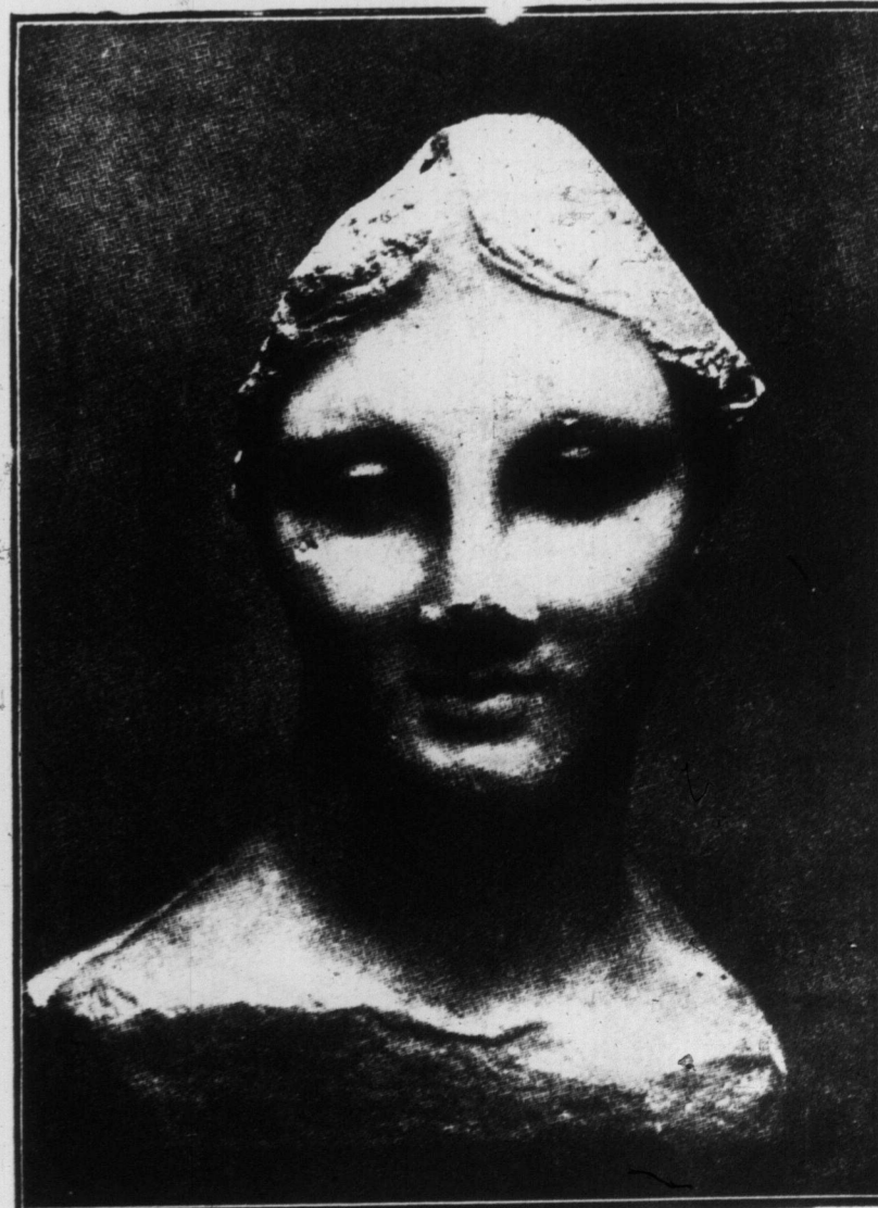
MOST REMARKABLE MARBLE HEAD IN EXISTENCE.

This head has recently been placed in the Museum of Fine Arts at Boston. It is clearly a Greek original of the fourth century from the hand of a master.