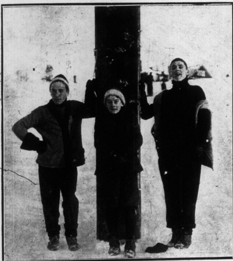
A LIVE BUNCH OUT FOR THE DAY.

A scene at the well-known horse market during one of their Tuesday sales. There is a spirit of business about this market that is convincing.