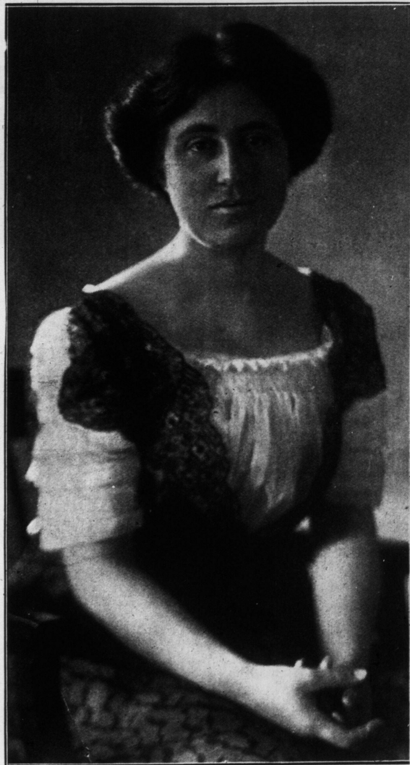
CHARMING LADY WHO ENTERTAINED OUR SINGERS.