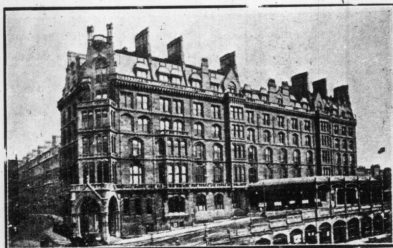
ST. ENOCH STATION HOTEL, GLASGOW.

A person naturally desires to go to some hotel, when he is in a distant city, which will give every comfort, all modern conveniences, pleasant surroundings and the advantages of close relations with important places etc. Scotland being one of the most picturesque places in Europe, it is only natural that the number of persons who visit such spots as Glasgow, Dum-