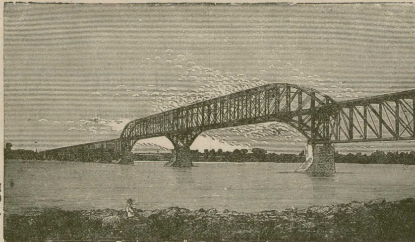
ST. LAWRENCE RIVER BRIDGE, CANADIAN PACIFIC RAILWAY, LACHINE, P. Q.

For Railways and Highways, Iron Bridges, Turntables Iron Piers and Trestles, Bridge Rods Right and Left Hand Sleeve Nuts and all kinds of Structural Iron Work.