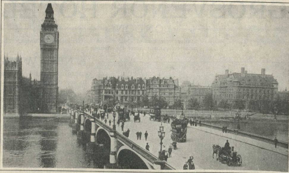
Westminster Bridge, London, England; Clock Tower Parliament Buildings on the left, and St. Thomas Hospital buildings on the right.