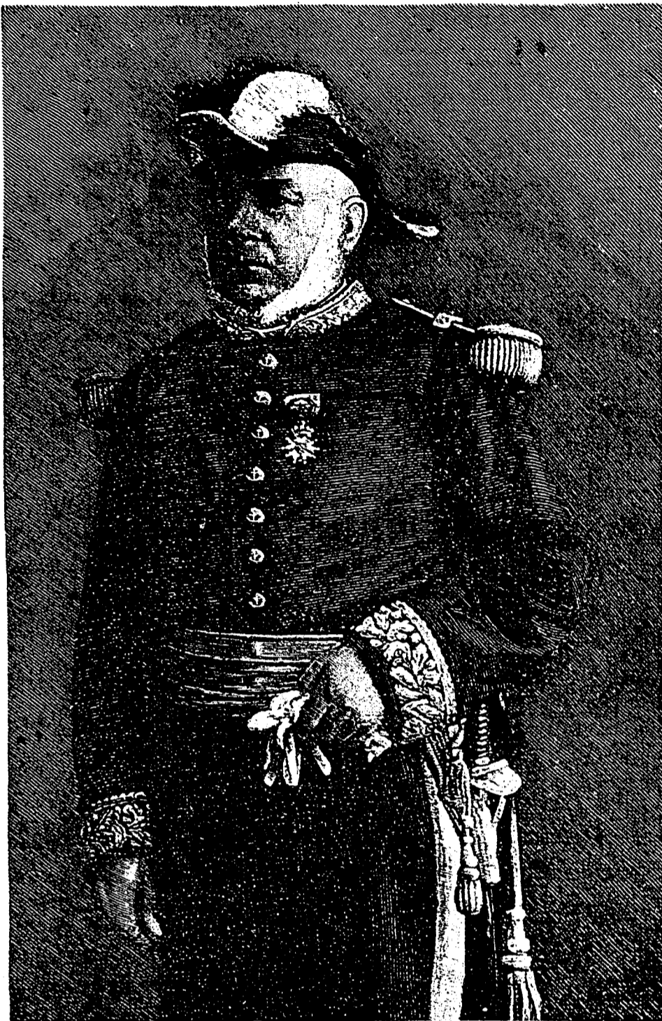
ADMIRAL PIERRE, LATE FRENCH COMMANDER AT MADAGASCAR.