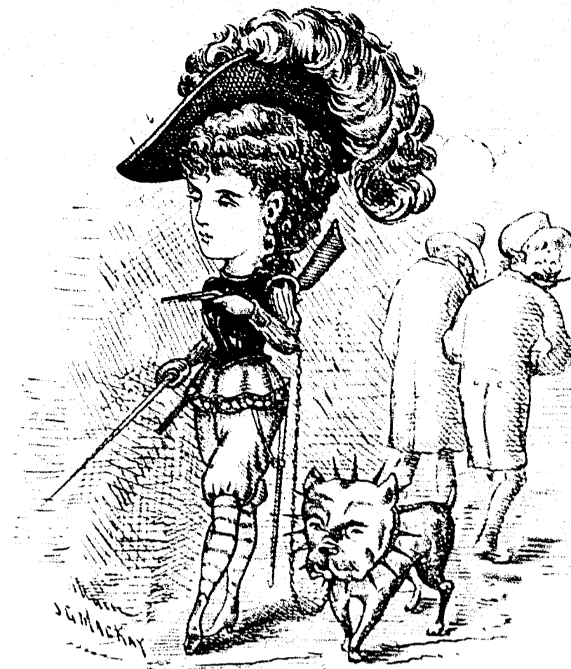
A FASHION FOR THE PERIOD. The present Fashionable style of dress, and the frequent attacks on ladies, have suggested the above happy combination of Panoply and Beauty.

Publisher, Book-binder, Manufacturing and WHOLESALE STATIONER, IMPORTER OF Wall Papers, Window Shades and SCHOOL BOOKS, 397 NOTRE DAME STREET, MONTREAL. 10-19-92-93-30.