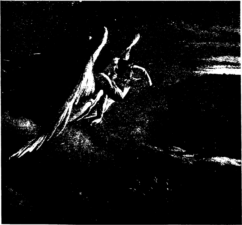
THE FIRST EASTER.