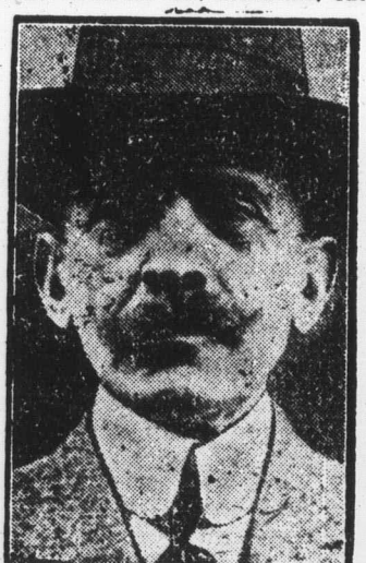
DR. SERGE VERONOFF.

Dr. Williams' Pink Pills should be kept in every home, and their occasional use will keep the blood pure and ward off illness. You can get these pills through any medicine dealer, or by mail at 50 cents a box or six boxes for $2.50 from The Dr. Williams' Medicine Co., Brockville, Ont.