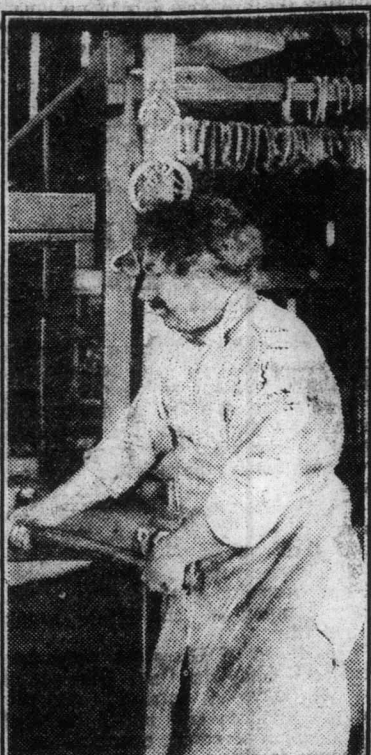
Luke Lovell Works as a Blacksmith's Helper.

She only knew that Arthur would not betray Blair and that Blair would not betray Arthur. She knew that while Blair secretly, yet with intense bitterness, hated his supposed cousin, Arthur had eagerly sacrificed himself for Blair. And now that Arthur, as John Powell, was indeed a golden man, Vivian remembered his strange attachment for Blair, and thought it well to apprise Blair of the change in the fortunes as well as the name of Arthur Stanley and have Blair come