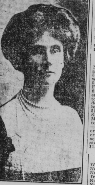
DUCHESS OF DEVONSHIRE.