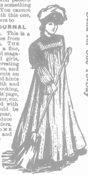
Send for One To-Day

Address Circulation Dep., 36 THE HOME JOURNAL TORONTO, CANADA