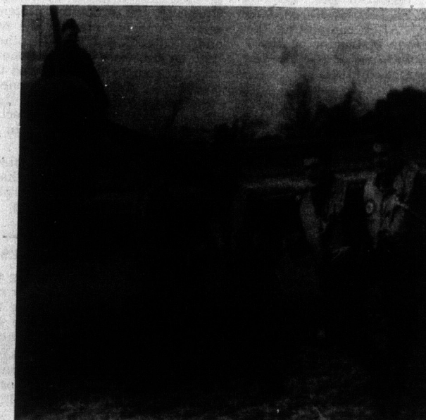
ON THE ALERT