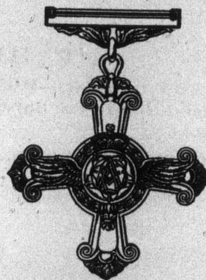
Distinguished Flying Cross

To all parts of the globe these men are going and will continue to go, manning planes of the United Nations. Across their bomb sights they will squint at industrial centres of the Nazis, tiled roofs of Japanese factories and ships of many sizes flaunting Axis flags. Through their gun sights, too, they will concentrate on aircraft bearing Fascist, Swastika and Rising Sun markings.