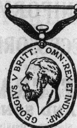
DISTINGUISHED FLYING MEDAL