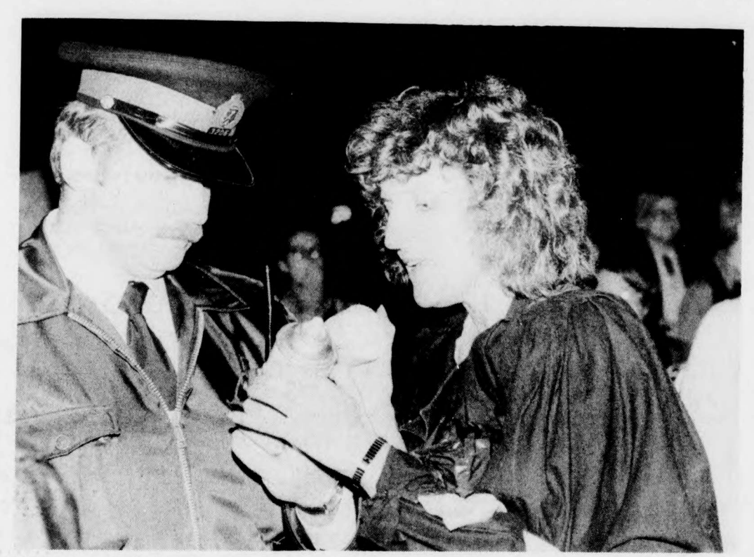
A Metro 31 division constable discusses the bavarian cream filling with a Tim Hrton's employee.