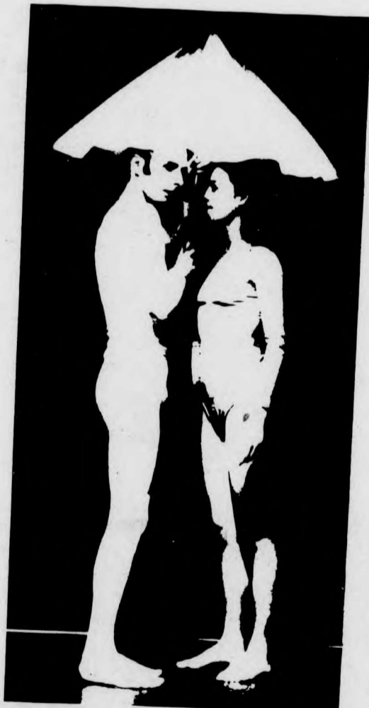
Paula Ross Dance Co.

EDOUARD LOCK DANSEURS Apr. 13-17, 8 p.m.