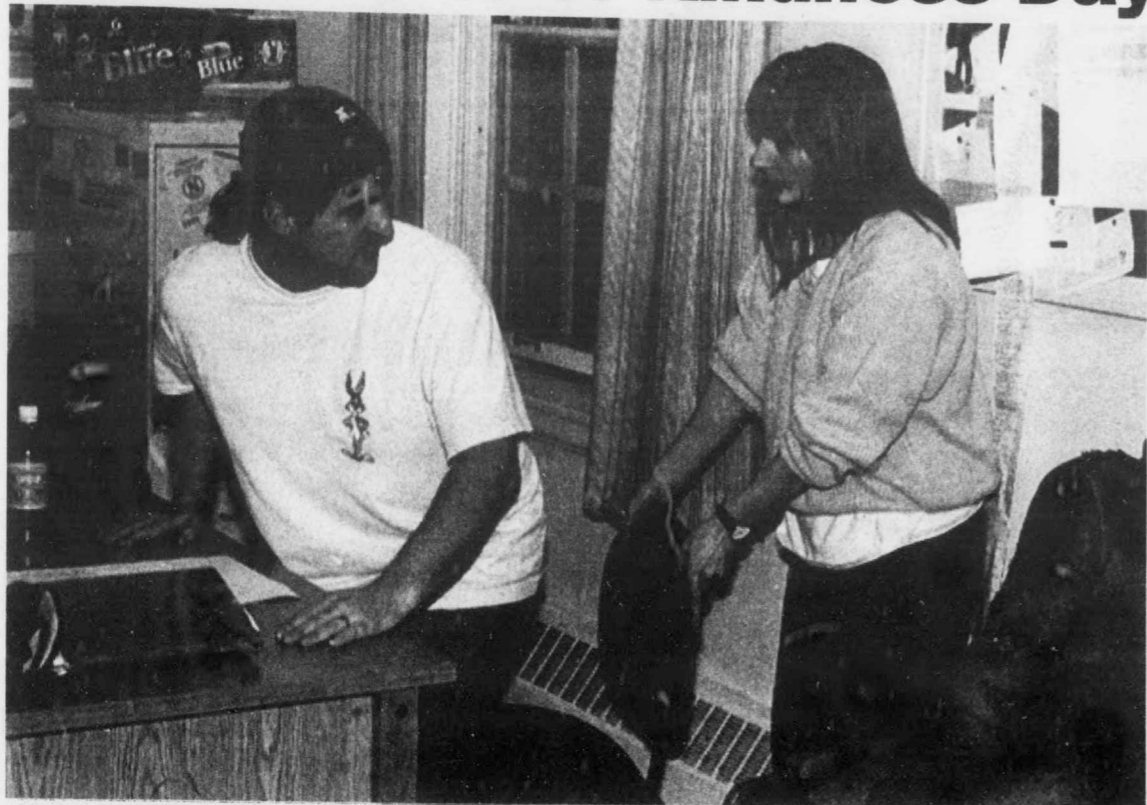
Simple acts like pushing in a chair can make someone's day