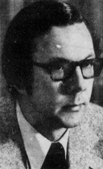
J. Hugh Faulkner

Canada's Secretary of State the Hon. James Hugh Faulkner will give a public speech at UNB in Fredericton Friday on "The Universities' Response to Bilingualism." His talk will be delivered in Room 105 of MacLaggan Hall at 8 p.m.