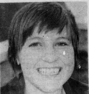
Phys. Ed. 1

There's not much emphasis placed on intra-mural sports anyway so they should spend more on intra-mural activities.