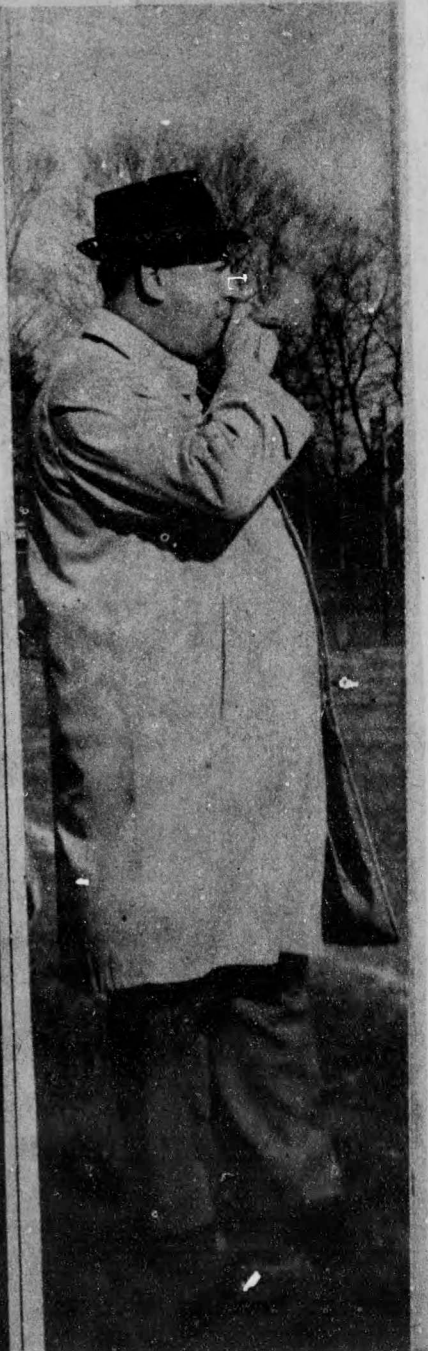
Thank Heaven for Cigars.