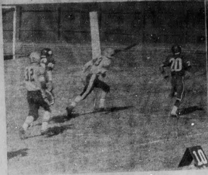
He Made It!