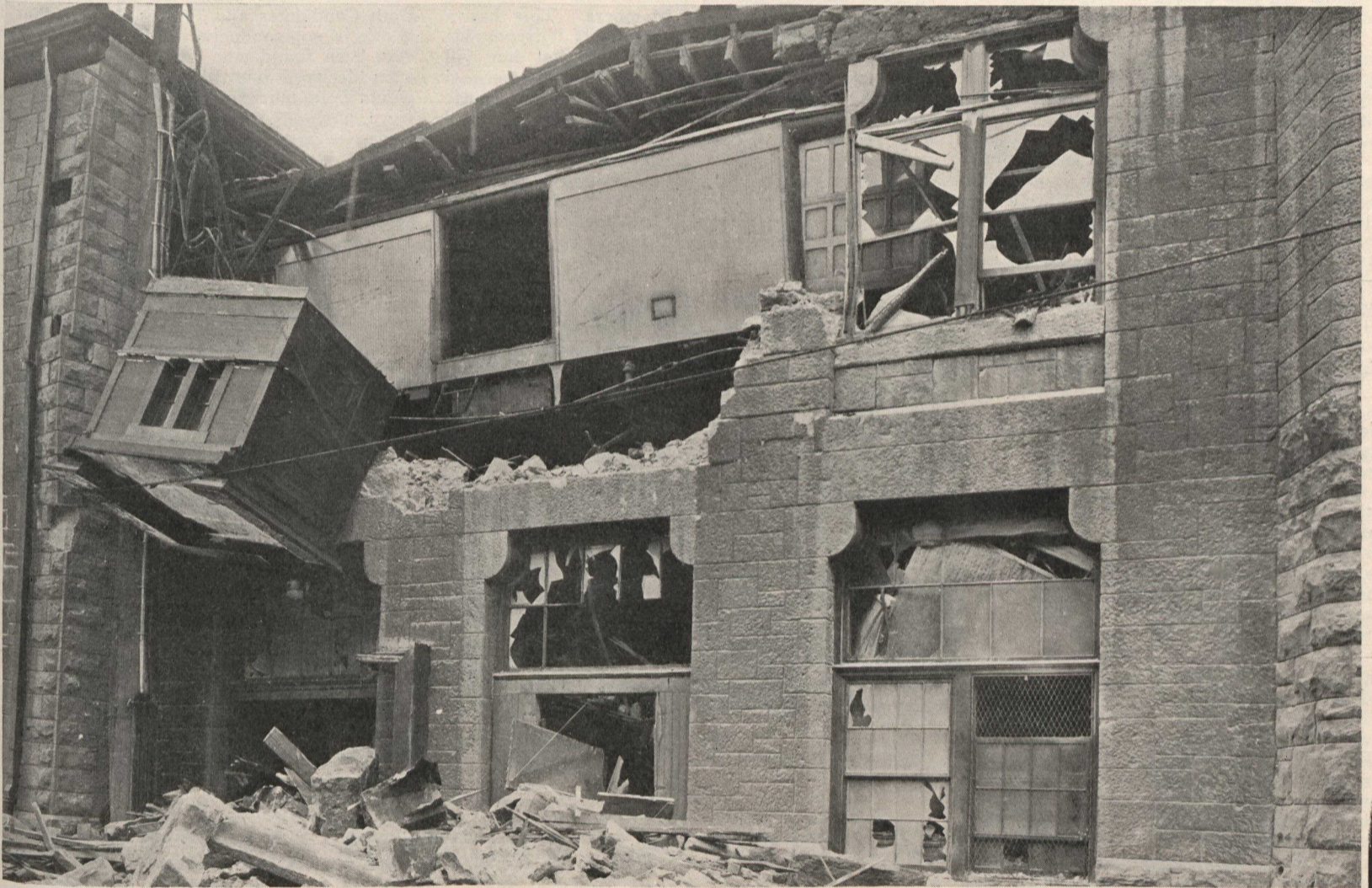
The Donegana Street View of the Station, showing the Baggage Car lodged in the Ladies' Waiting Room.

MONTREAL has terminal railway stations, that is station-houses built across the ends of the tracks instead of parallel to the tracks. Twice in the history of these stations, trains have gone too far and crashed into the buildings. The latest occurred on Wednesday of last week, when the Boston Express crashed into the Windsor Station. Fortunately it struck a portion of the building in which there were few people and the casualties were small. The passengers were uninjured. Investigation shows that some miles out, a plug had blown out of the engine and the escaping steam had forced both fireman and engineer out of the cab before the throttle could be closed or the "emergency" released. Without engineer or fireman, the great mogul swept through the yards and into the station at a speed which was lessened only by the brakes applied by the brakeman. Apparently there was no criminal negligence of any kind whatsoever, as is too often the case. The station will be repaired shortly, and further enlargements of this largest station-house in Canada are also being planned.