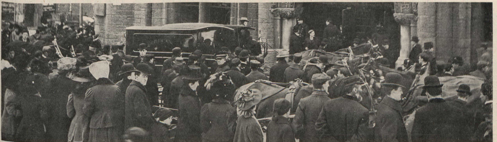
The Ambulances at the Main Entrance after the Accident.