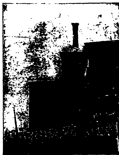
The same Chimney AFTER THE American stoker was installed.