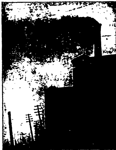
Photograph of a Chimney BEFORE the American Stoker was installed.