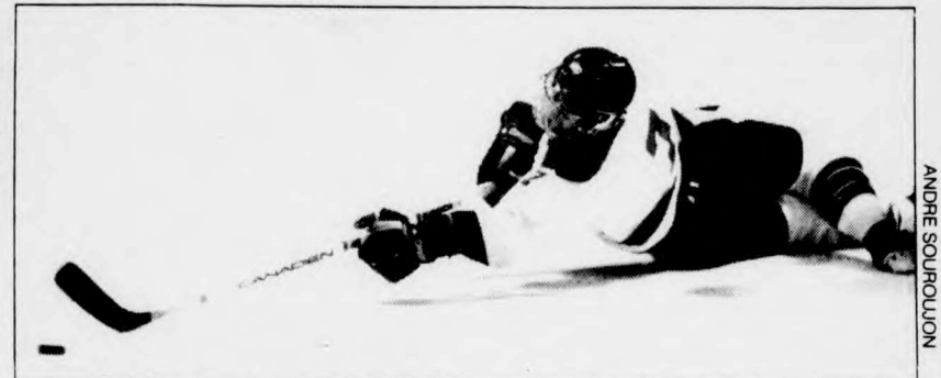
THE ONE THAT GOT AWAY: York dazzled Waterloo in Game 3 with nifty moves like these. The Yeomen overcame Friday's loss to win 3-1, clinching the series. York faces Laurier in the OUA final.