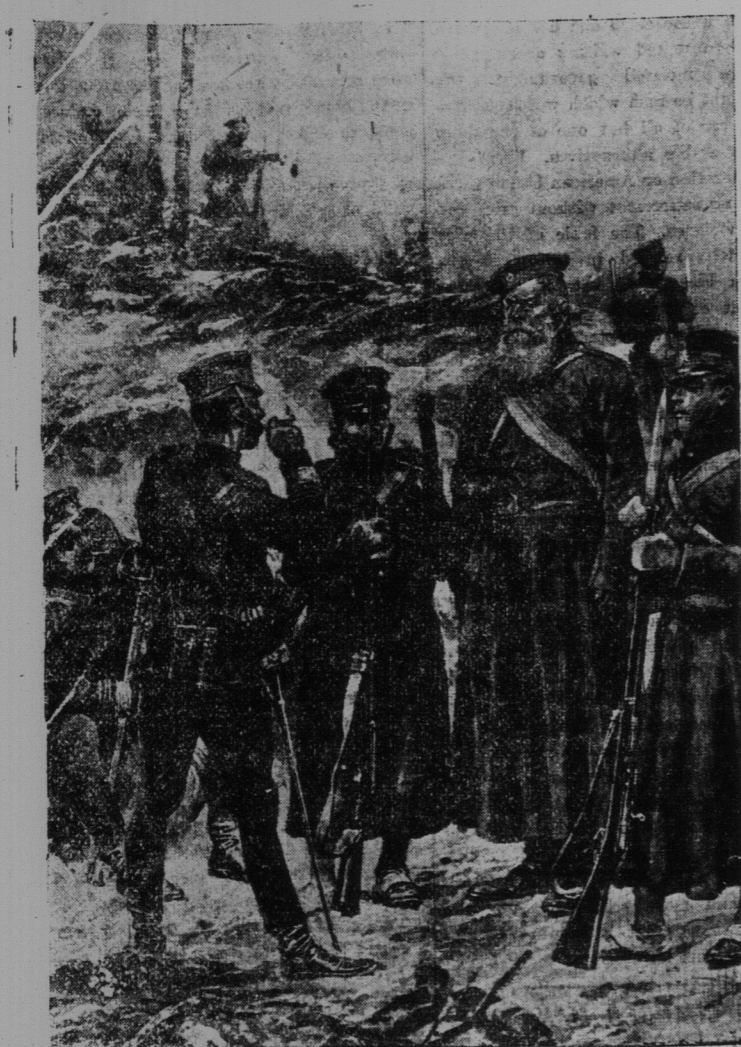
A Russian Soldier Captured by a Japanese Outpost.