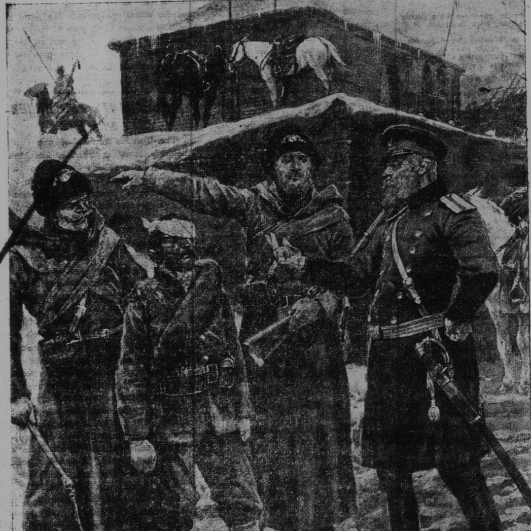
A Japanese Soldier Captured by a Russian Outpost.