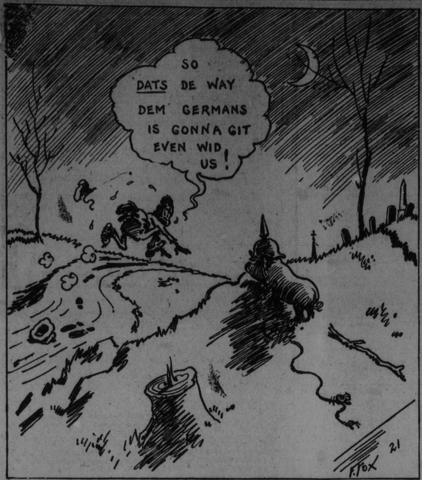
Right By The Village Graveyard The Other Night Sambo Ran Into That Pig Which Escaped From The Toonerville Peace Celebration Parade.